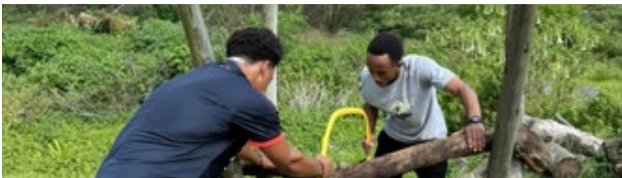
Students working together in the Woodchopping CAS group.

Welcome back to CAS, all students! Everyone has now received a place in their respective CAS (Creativity, Activity, Service) groups. Hopefully everyone is happy! We have many recurring groups from last year available, with the addition of a couple of new ones. The CAS groups range from beekeeping, to first aid crew, to Goshen women's shelter, all the way to Permaculture and gardening. The wide spectrum of activities in which our students have the opportunity to participate in gives them both a chance to improve the local community, in addition to getting valuable life experiences and lessons.