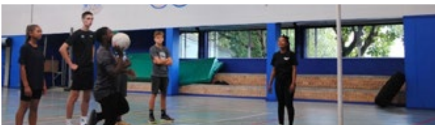
Students learning from each other in Giving Back in Sports.